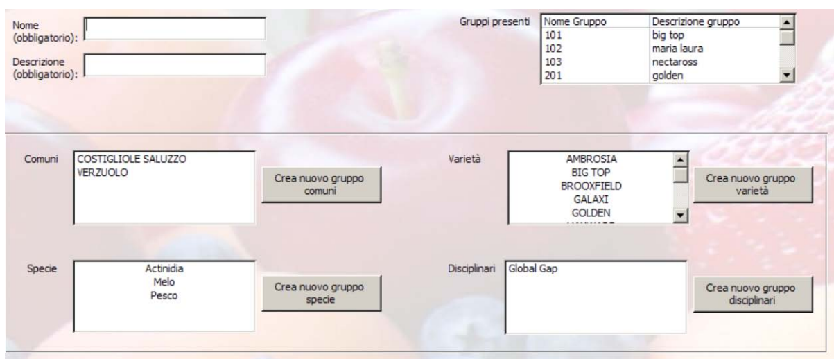
Figure 3. Operations that can be carried on the new group form

The management of homogeneous groups of particles, called minimum lots, it is essential to speed up the records of treatments and fertilization, which can be executed on the group, not on the individual lot. The group is a set of minimum lots, homogeneous on some characteristics, created on purpose by the user. What differentiates the tool developed is the ease in the composition of groups with operators as intersection, union and negation of sets.