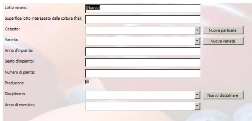
Figure 1. Form for the insertion of the single parcel

Minimum Lot: small lots are inserted, i.e. the single field portion on which is cultivated the same with the same year of planting. This means that in a single field we can register more than one minimum lot. For treatments, fertilization and harvesting operations, the small lots are grouped into homogeneous entities referred below as groups. The group includes small lots homogeneous by species or varieties, or parcels located in a certain defined area of the farm.